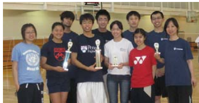
University of Pennsylvania won the 2009 IBA Mixed Team Championships

NBL Middle School Leagues is a new program that will be developed in 2012. Since badminton is an interscholastic (high school) sport in California, Illinois, Arizona and Minnesota, those states will be the initial target markets for the middle school program.