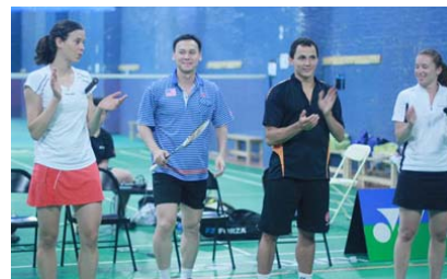
(Right) Team introduction of the Seattle Smash before their match against the New York Nets, July 2011.