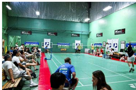
(Left) Pasadena Racquets versus California Walnuts at San Gabriel Valley Badminton Club, 2010.

The Eastern Conference Champions and Western Conference Champions will play in the NBL Finals on Sunday, July 8 in Los Angeles.