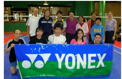
Winning team from the 2009 NBL California State Playoff

NBL Recreational Leagues offer healthful, competitive and social opportunities for youth, adults and seniors of all playing abilities. NBL Recreational Leagues are played at clubs, community centers, YMCAs and any other facility that has space for at least one badminton court. Winning teams have the opportunity to advance to state, regional and national competitions.