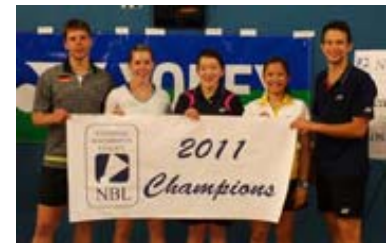
Los Angeles Strings 2011 NBL Pro League Champions

The NBL Professional League completed its first season in 2010 with three teams based in Southern California. In 2011, the league had teams in three cities: New York, Los Angeles, and Seattle. Players earn prize money based on individual and team results, and matches are played in venues that have seating for 500 to 2000 spectators. To help promote the sport, NBL gives free admission to anyone under 19 years old.